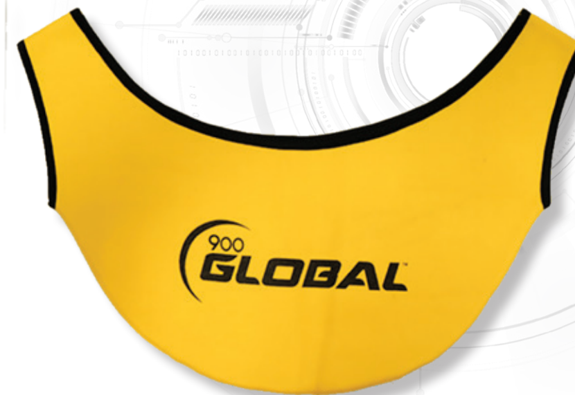
900 GLOBAL SEE-SAW SKU# GA1100

The 900 Global See-Saw features an oversized construction which will provide a large cleaning surface. This stylish see-saw will protect your bowling ball during storage in a bag or locker. This durable material is also 100% machine washable.