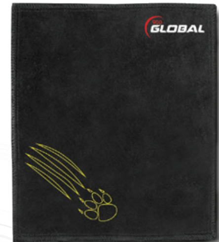
900 GLOBAL CLAW SHAMMY SKU# GT0503