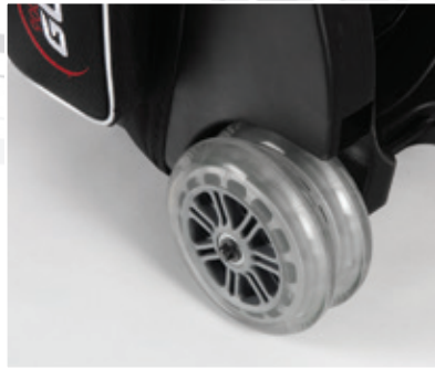
TWO WHEELS PER SIDE FOR BETTER BALANCE AND STABILITY