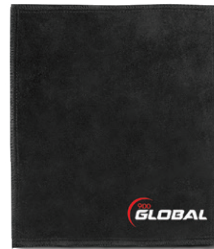
900 GLOBAL SHAMMY SKU# GT0502

The 900 Global Shammy was designed with one purpose in mind... removal of oil. It is critical to keep oil out of the cover of the ball. Wipe your ball down with the shammy prior to every shot and you will see increased performance shot to shot. When your shammy gets dirty, all you have to do is hand wash it in the sink and let it air dry.